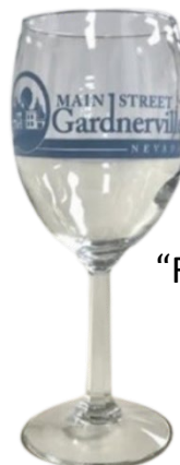
Official “Forever Glass”

Participating businesses are not allowed to partner or host any political entities during wine walks.